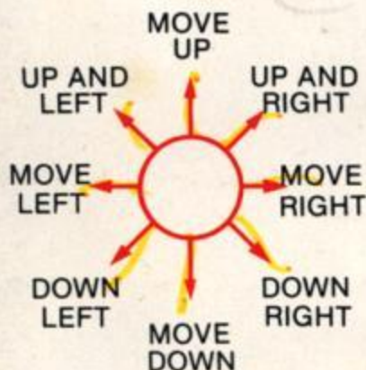
How to control outfielder(s)