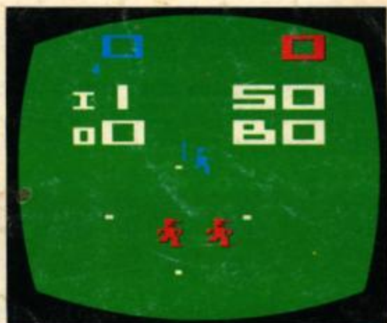
Games 2 and 6 playfield