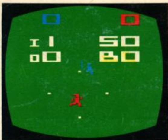
Games 1 and 5 playfield