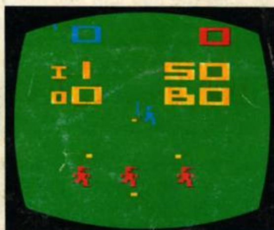
Games 4 and 8 playfield

The white letters at the top left of the playfield are; I innings, 0 outs; the white letters at the top right of the playfield are; B balls, S strikes. The blue number is the left player's score; the red number is the right player's score.