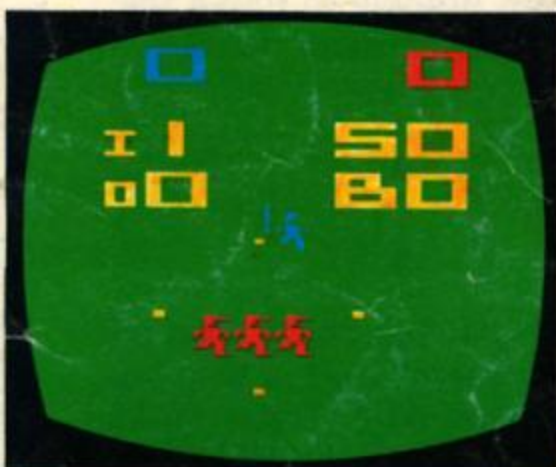
Games 3 and 7 playfield