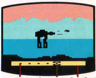
5 Walkers Snowspeeder Radar Band

Remember: As soon as the lead Walker reaches the right end of the radar band, it blows up the power generator and ends the game. Just before this happens, however, you'll hear a "warning" sound, then the sky will begin flashing.