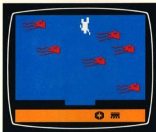
Figure 3 — School of Octopi

To enter a room with the power to manipulate all the objects in that room with your Joystick, you must guide your playing figure to the opposite side of the screen from where you start.