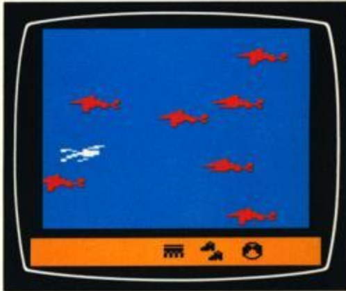
Figure 2 — Sea of Sharks

"...and I know a chariot goes in another..."