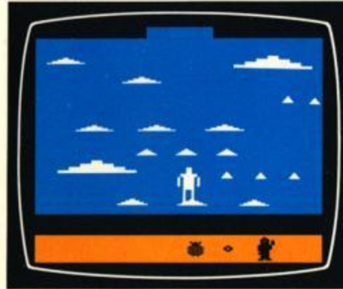
Figure 4 — Ice Floes

When you do complete a skill-and-action test successfully, an image of the Ultimate Sword of Sorcery will appear momentarily before you enter the room. If you are not successful, the word "SWORDQUEST" will appear before you are placed in the room.