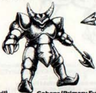
Gobanz (Primary Evil)