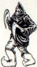
Zeldo (Primary Evil)