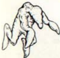
Under Mole (Primary Evil)