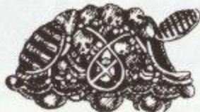
Krypto-Crustacean (Level 5)