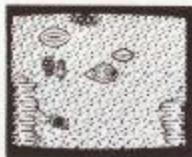
Jagger Froid's Fruit-of-the-Doom Defense Line (Level 6)