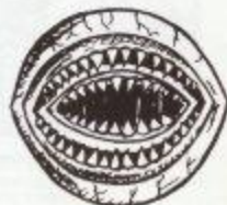
Lip-O-Suction (Level 6)