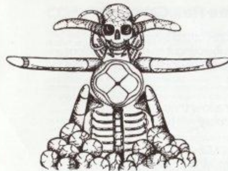
Temple of Terror (Level 7)