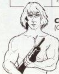
Corporal Lance (Code name: Scorpion)