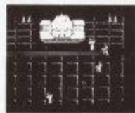
Fort Fire Storm's Warped Mind Command Center (Level 2)