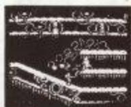
Red Falcon's Poison Palace (Level 8)