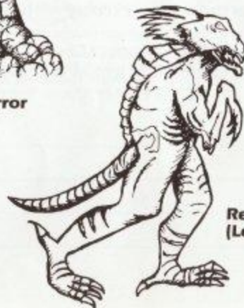
Red Falcon (Level 8)