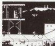
Gates of Fort Fire Storm (Level 1)