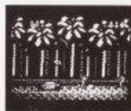
Tropics of Torture (Level 3)