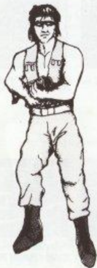
Alien in Sergeant Skin's Clothing (Level 1)