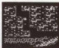
Radioactive Lava Fields (Level 7)