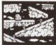
Massacre Mountains (Level 5)