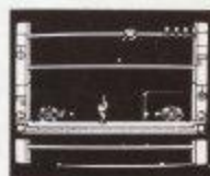
Lair of the Jungle Aliens (Level 4)