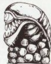
Jagger Froid's Spit Soldier (Level 8)