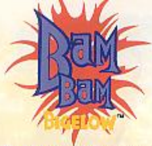
BAM BAM BIGELOW™ 6'6", 360 lbs. Asbury Park, New Jersey

Incredibly agile for such a big man, Bam Bam uses an aggressive fighting style to take advantage of his opponents. This aggressiveness is demonstrated in everything he does, from his favorite move, a headbutt off the top rope, to his bald head that has been tattooed with flames!