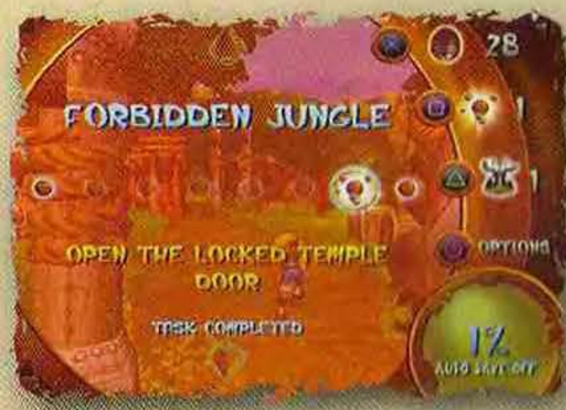
Status Screen Objective status can be accessed by pressing the "Start" button.