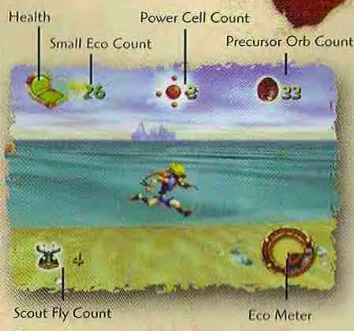
Game Screen Info Game screen info can be accessed by pressing the L2 or R2 button.