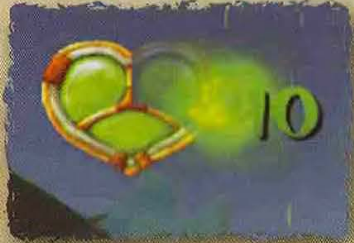
Health Meter Watch your energy status. Look for Green Eco when you're low in health points.