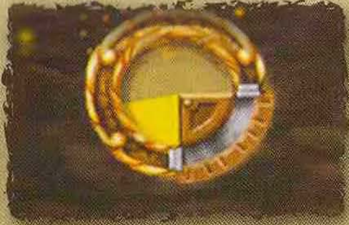
Eco Meter The Eco Meter allows you to gauge your Eco levels and measures time left to use Eco power.