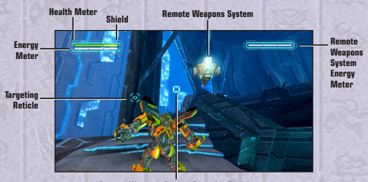
Remote Weapons System Targeting Reticle

Health Meter – Displays your remaining health. When the meter is drained you'll be defeated.