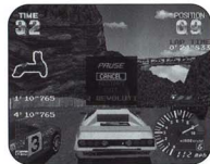
Menu Screen When Paused

EXIT: Returns you to the Game Mode Selection screen.