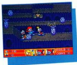
Sci-Fi film stage