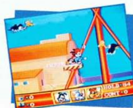
Water Tower/ Rescue stage