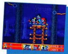
Adventure film stage