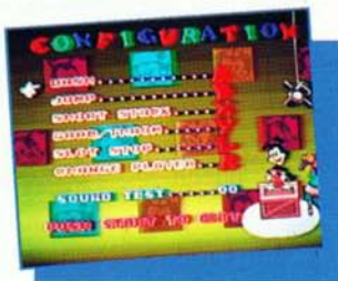
Option Mode screen

Select OPTIONS from the Title screen and press the START button. You can change button settings (key configuration) in this mode.