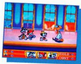
Practice stage Studio HQ