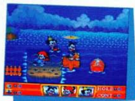
Aquatic film stage