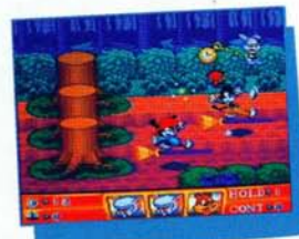
Fantasy film stage