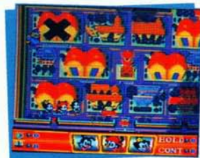
Warner Bros. Studio screen

Once you clear the practice stage, you cannot enter it from the Warner Bros. Studio screen. The Warner Bros. Studio screen appears as you clear each level. The player enters an individual studio by moving the Animaniacs along the paths to the film studios.