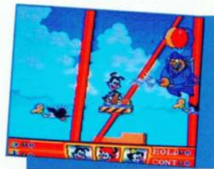
Recovery Stage screen