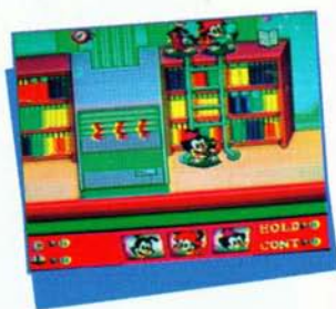
No. of Script Scenes

The final scenario of the game varies depending on whether or not you've collected the entire script when the game ends.